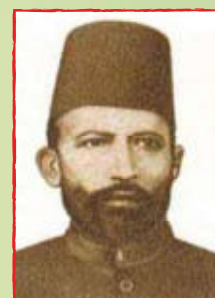
Hakim Ajmal Khan